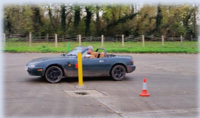
'Fast Car' Mazda MX5 – Zac Lower – FTD.